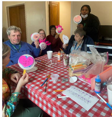
Park Hill Residents crafting Valentine's day cards.

We are THRILLED to announce that we EXCEEDED our year-end goal, raising OVER $24,000! This incredible achievement reflects the COMPASSION and SUPPORT of our community. These funds are directly IMPACTING our residents by ENHANCING their living experiences through IMPROVED amenities, personalized care programs, and vibrant community activities that foster CONNECTION and engagement. Together, we are making a REAL difference in the lives of those we serve, ensuring they live with DIGNITY and JOY. We appreciate your SUPPORT year-round.